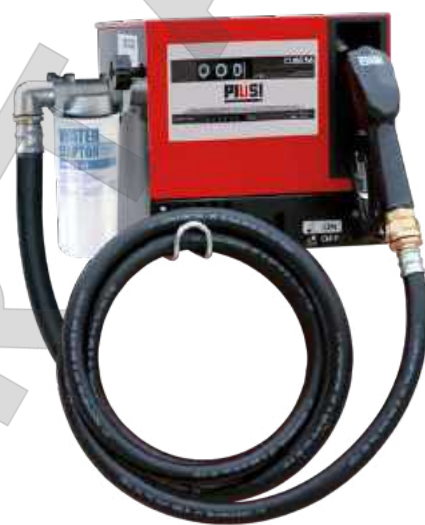
CUBE 56 WITH FILTER