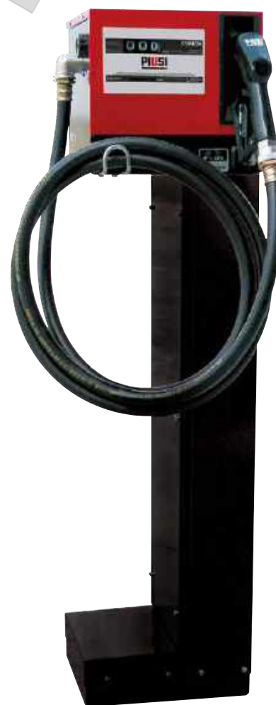
CUBE 56 WITH PEDESTAL (OPTIONAL)