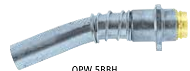
OPW 5BBH 7HB ® Spout without ring

NOTE: See OPW's Website at www.opwglobal.com for product instruction sheets, trouble-shooting guides, how-to-use guide and to view the Do's & Don'ts at the Gas Pump video.