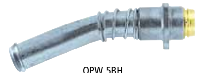
OPW 5BH 7H ® Spout with ring

7H ® , 7HB ® Series Instruction Sheet Order Number: H15985M