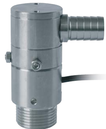
TURBINOX - TURBINOX 90°