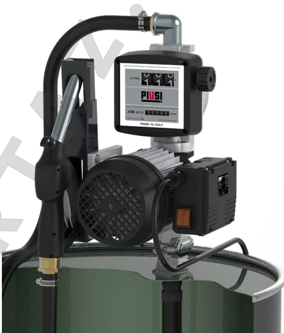
VISCOMAT VANE DRUM