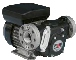
AC PUMP - PANTHER 56/72