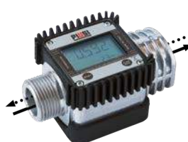
ELECTRONIC METER - K24