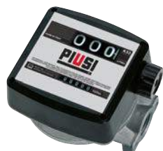
MECHANICAL METER - K33