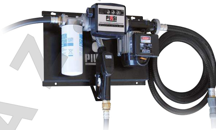
ST PANTHER 56, K33, A60 AND WATER CAPTOR