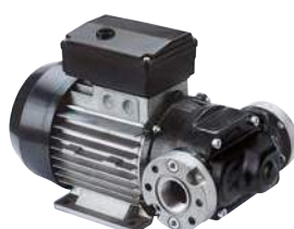
AC PUMP - E120