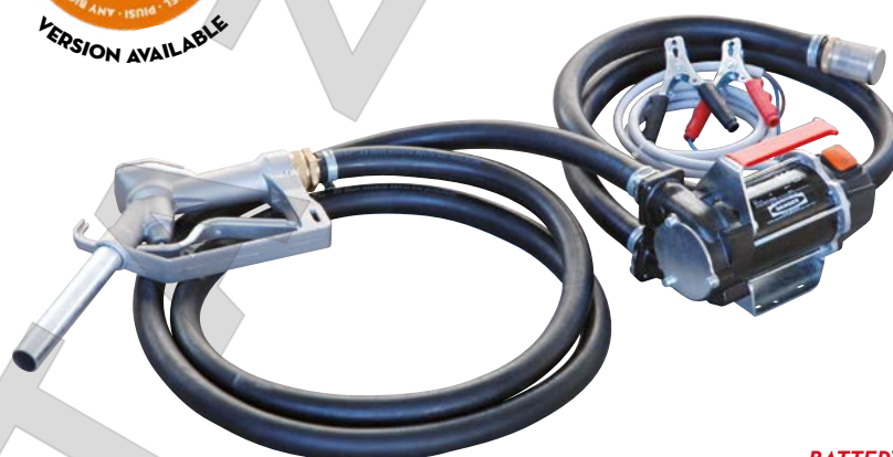
BATTERY KIT 3000