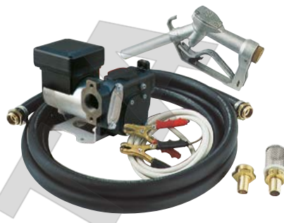
BATTERY KIT PANTHER