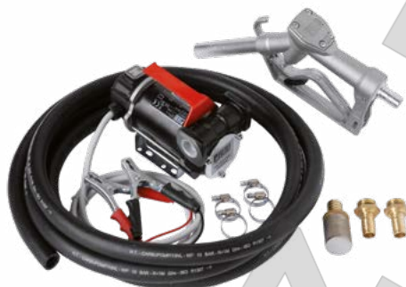
BATTERY KIT 3000 INLINE