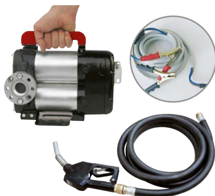
BATTERY KIT BIPUMP