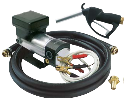
BATTERY KIT OIL